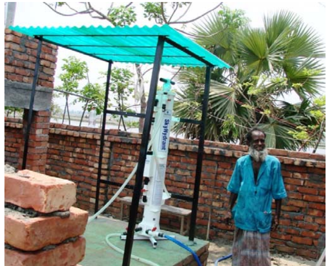
Australian and Danish Consular officials ( project funded by AUSaid and Danish Aid) attending a education session on operations and maintenance of the SkyHydrant water filtration unit