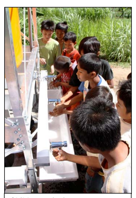
Children enjoying easy access to safe potable water at the wash station, which includes bubblers and self closing taps

The generous donation by Siemens Water Technology employees has, and will continue to, make a real and tangible difference to the lives of hundreds of people in Lombok for many years to come. All components of the SkyHydrant water system are high quality and durable which means that the community will not be burdened with any ongoing maintenance costs.