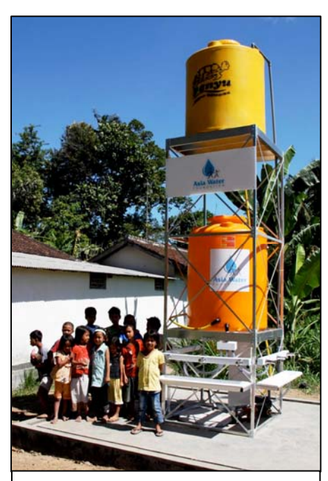
The newly developed SkyTower offers a safe, sturdy tank stand with wash station for the school children