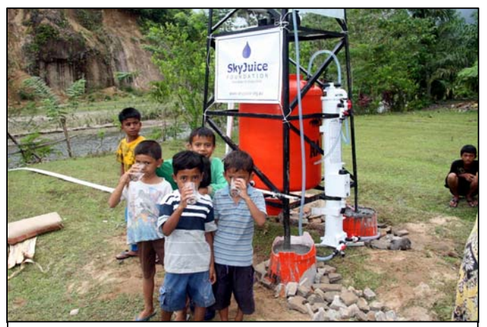
Children enjoying a drink of safe water from the SkyHydrant water treatment system

Padang Karambia, Pariaman District. This unit is serving approximately 143 families (approximately 500 people altogether) plus the nearby village.