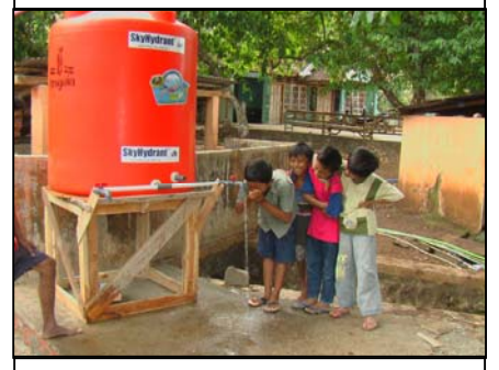
Safe water for the village of Gunung Kidul