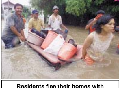
Residents flee their homes with minimal possessions