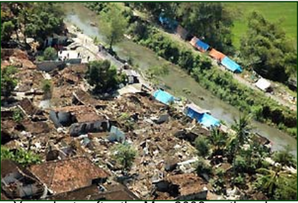
Yogyakarta after the May 2006 earthquake

The Wonosari Project - 80 kilometres from Yogyakarta is the impoverished village of Gunung Kidul in the District of Wonosari. The village has approximately 180 families (630 people). The village water supply is also the water source for a further 4 villages nearby. The existing water infrastructure is a combination of individual and shared ground wells. This is insufficient for the community and many families have to rely on untreated river water. The local health clinics report that diarrhoea and respiratory tract infections are common due to unsafe water and lack of adequate sanitation. The SkyJuice Foundation in conjunction with the Australian Indonesia Business Council and the NSW Parliament Asia Pacific Friendship Group installed a SkyHydrant water filtration unit for the Wonosari village in September 2007. The Sultan of Yogyakarta nominated Wonosari as the most appropriate site. The village chief and committee eagerly undertook maintenance and operations training and quickly saw the many advantages of having immediate access to clean potable water.